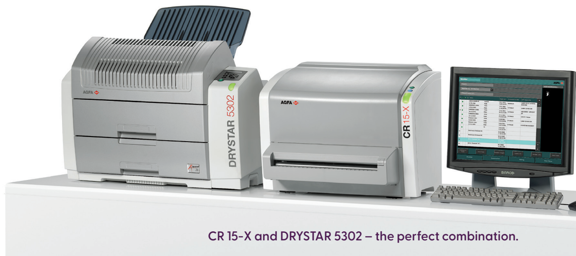
CR 15-X and DRYSTAR 5302 – the perfect combination.

The CR 15-X, MUSICA workstation and SE software suite deliver a seamlessly integrated solution.